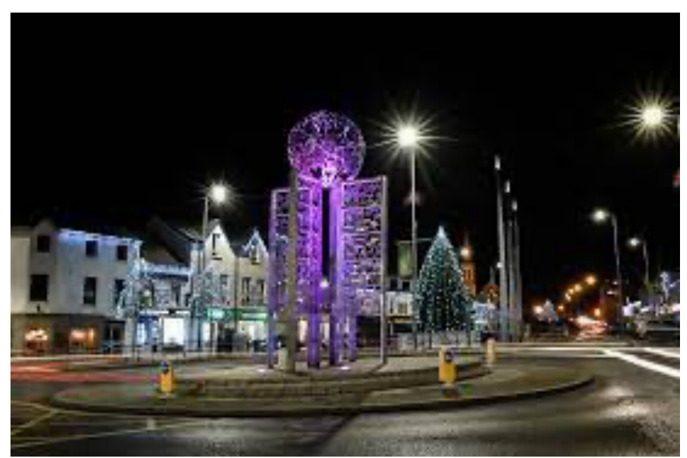
Magherafelt is quite a large town located in the South of county Derry. Magherafelt is a hiving town with plenty of Bars and Excellent Restaurants.

When in Toome proceed to the main roundabout and turn left on the dual carriageway towards Derry, continue on this road for about 5 miles until you come across another main roundabout and take the 2<sup>nd</sup> exit into Magherafelt.