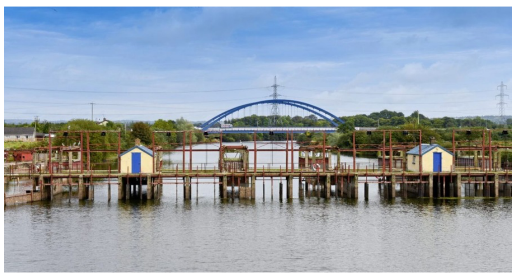
Toome Eel fishery is the largest producer of wild caught eel in Europe and is very prominent on the outskirts of the village or from the bypass bowstring bridge over the River Bann.

Turn right at the end of the driveway for 5 miles until you reach a tee junction, turn left for the village or turn right for the Park and ride for bus links to Derry or Belfast.