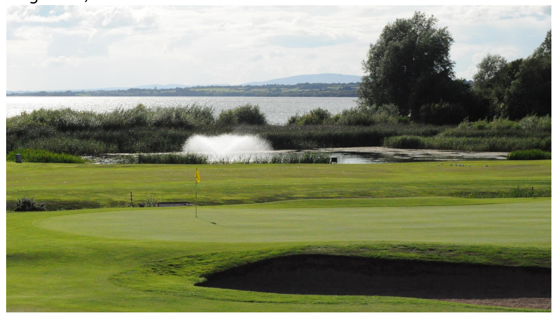
Masserene – view over the Lough