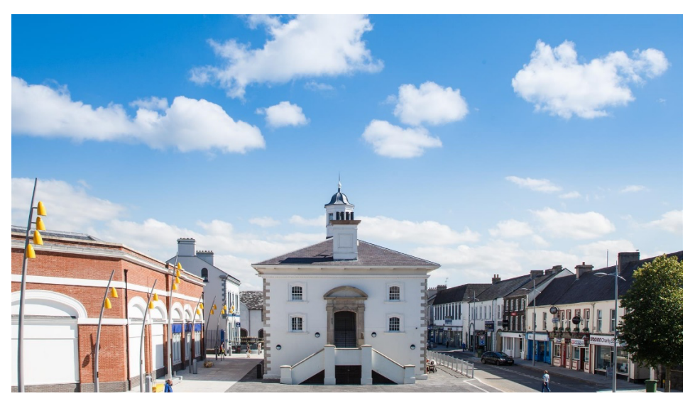
Situated on the banks of the Six Mile Water and Lough Neagh, Antrim is also home to the historical 400 year old Castle Gardens & Clotworthy house which following a £6m restoration project is well worth a visit offering beautiful walks and surroundings.

When in Randalstown proceed into the town until you come across a mini roundabout, turn right here and head towards the viaduct and bridge, continue for 1 mile until you come across the main motorway roundabout, Antrim, Belfast, Derry are all well signposted from here.